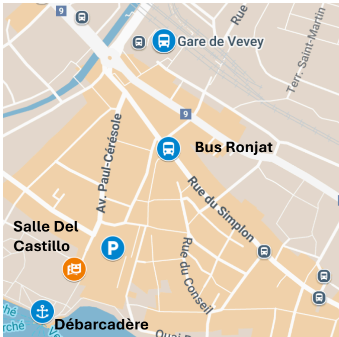
Figure 1 Map Vevey and Del Castillo Hall