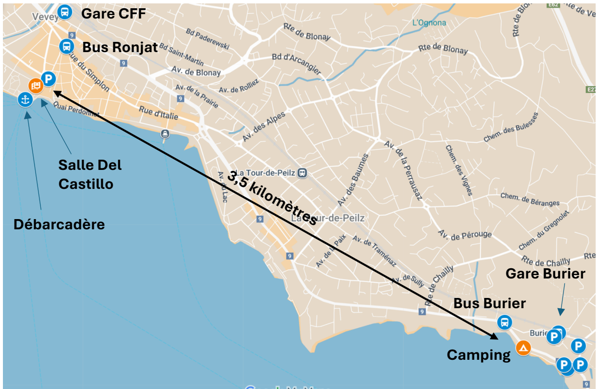
Figure 3 Map Vevey-campside location